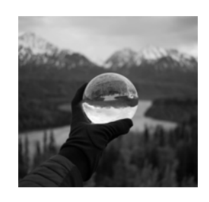
Advanced & intuitive search engine